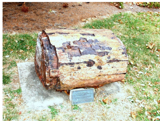
Petrified wood at the Town Hall

Now you know all about it; forget it and let another generation think they have an exotic piece of the universe in their backyard.