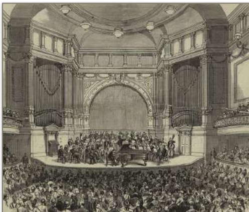
Chickering Hall, New York City

concert hall with sound. It had 36 ranks (a row of pipes all of which make the same sound, but at different pitches) and 2,001 pipes.